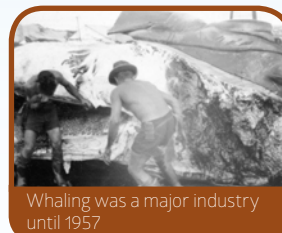
Whaling was a major industry until 1957