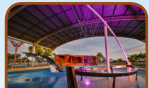
The boat at the Water Spray Ground represents the rich maritime history of the North West Cape

Pearlers regularly scoured the Cape between 1818 and 1899. The pearling fleet in the Exmouth Gulf was decimated by a cyclone in 1876 and the industry relocated to Broome where it remains an important part of the Western Australian economy.