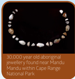
30,000 year old aboriginal jewellery found near Mandu Mandu within Cape Range National Park

Aboriginal people have had a long, cultural connection with Cape Range Peninsula. Many historical remains have been found along the coast including middens, fish traps, burial grounds and one of the world's oldest pieces of jewellery - the 30,000 years old 'Mandu Mandu' shell jewellery. Today the Jinigudjira and the Baiyungu people are recognised as the traditional owners of these lands.