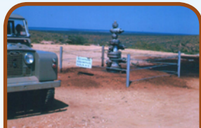
Oil exploration on the North West Cape in the 1950's

Today, offshore oil and gas exploration and mining is a major industry with rigs visible on the horizon.