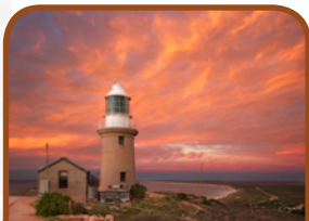
Vlamingh head lighthouse is no longer in operation but has been carefully restored and is the only lighthouse in Australia that can still function via kerosene lamp