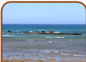
The SS Mildura wreck in 1907 led to the construction of the Vlaming Head Lighthouse (commissioned in 1912)

The next visit was by another Dutchman Willem de Vlamingh in 1696 who named the North West Cape and Australian Captain Phillip Parker King surveyed the area in 1818 naming the Exmouth Gulf in honour of Viscount Exmouth.