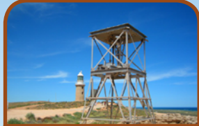
An aircraft early warning radar was set-up on Vlamingh Head to warn of approaching Japanese Bombers