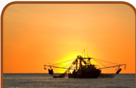
The prawn industry began in the 1960's and Exmouth prawns are now famous worldwide