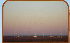
The Very Low Frequency Communications towers led to the establishment of Exmouth Town