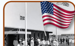
The communications base was originally run like a mini US town