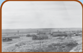
The Potshot Base was bombed by the Japanese during WWII. This area is now a memorial site