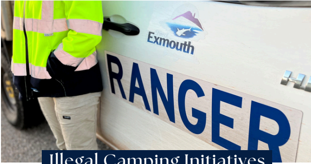
Illegal Camping Initiatives