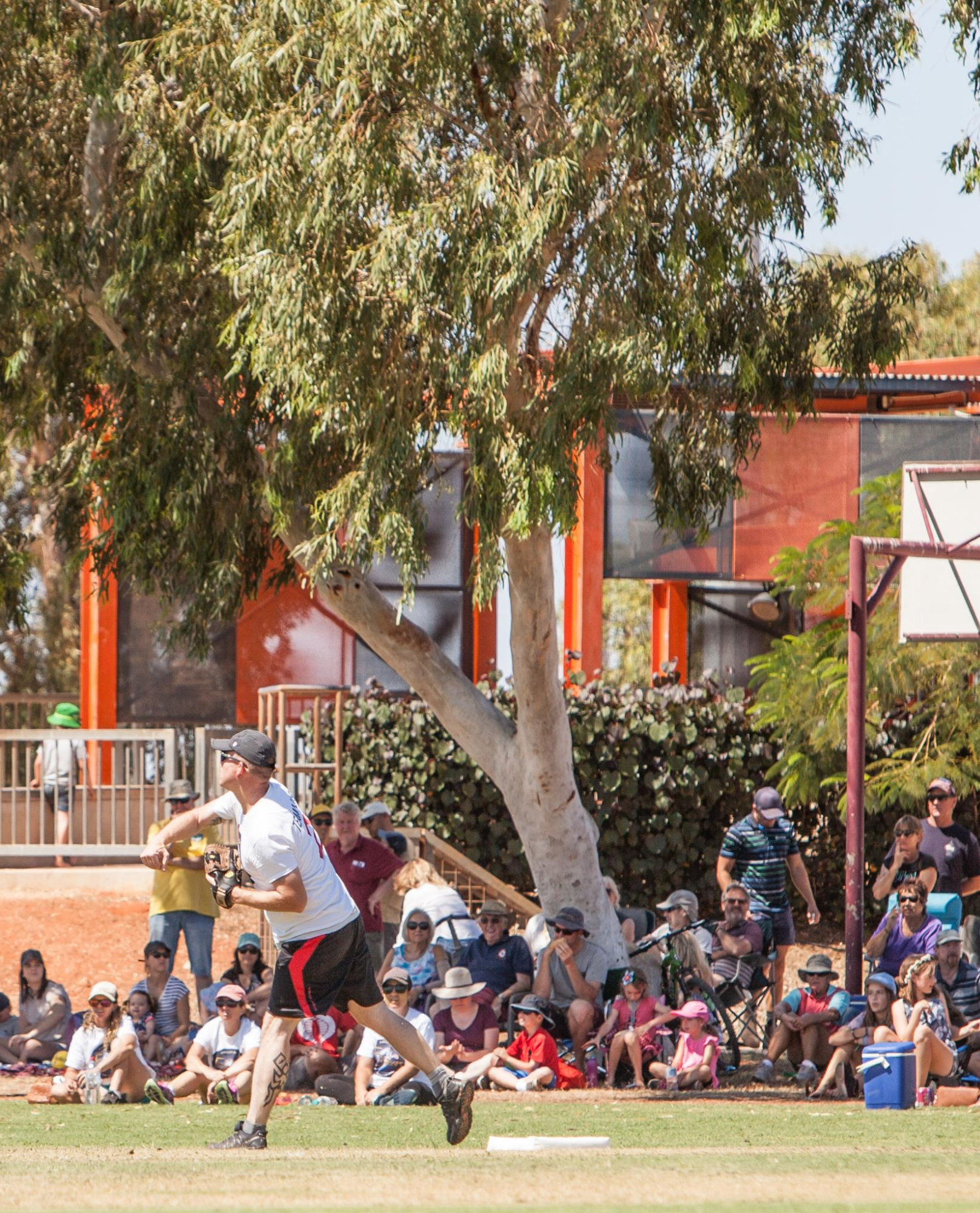
Exmouth 50 th Anniversary Celebrations