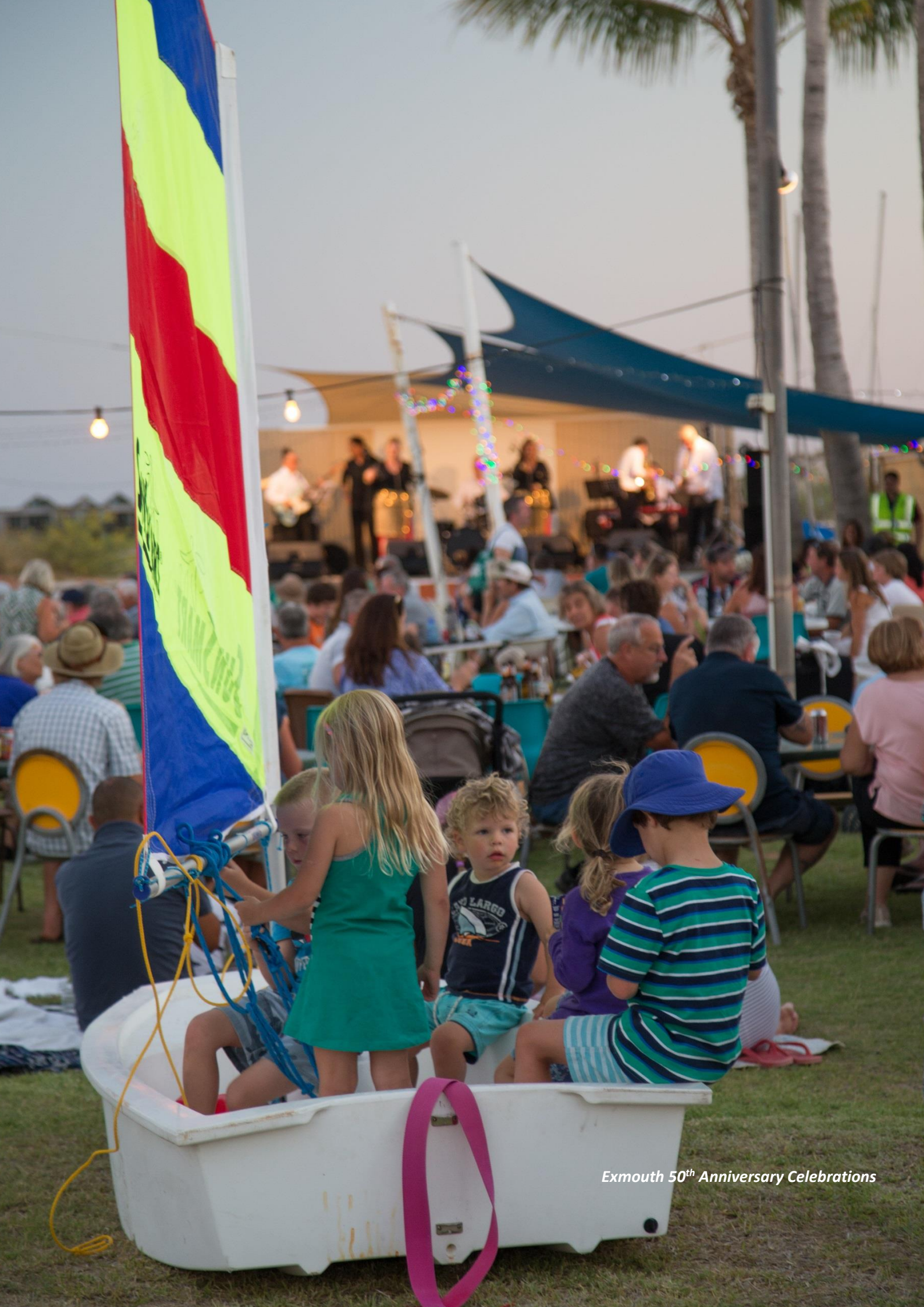
Exmouth 50 th Anniversary Celebrations