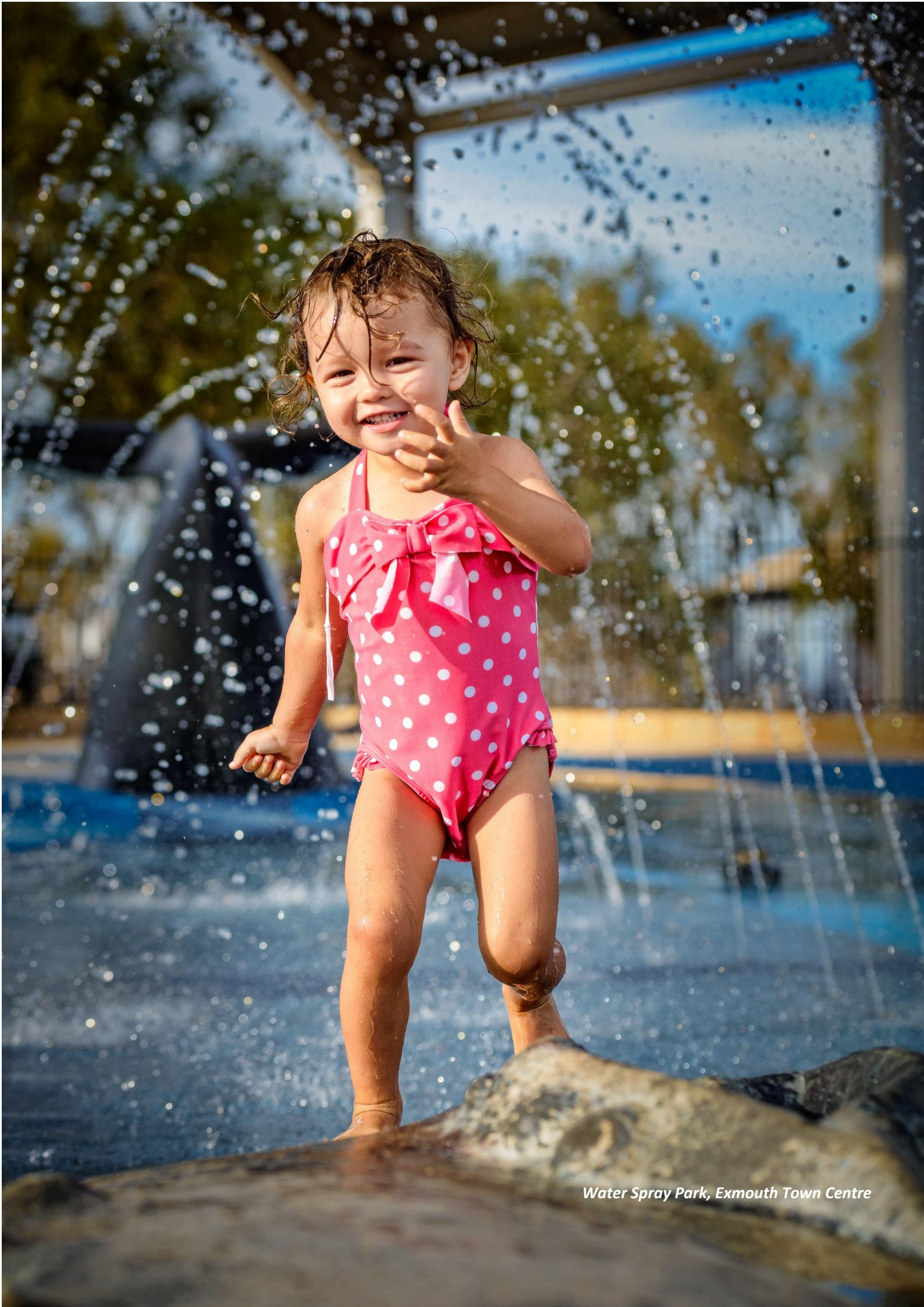
Water Spray Park, Exmouth Town Centre