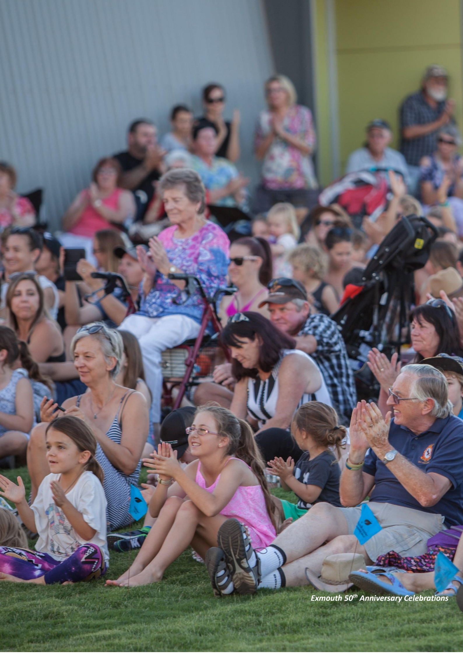
Exmouth 50 th Anniversary Celebrations