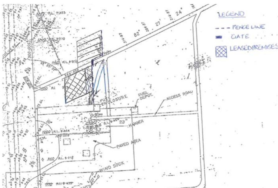
Figure 1 - current lease boundary Lot 73

Included in the original lease was the option for a further 10 year term at the Lessors discretion. The option to renew clause within the original lease agreement is as follows;