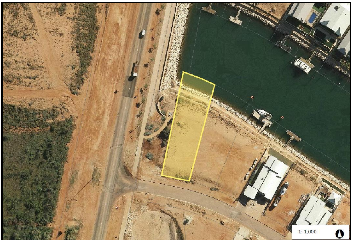
Lot 328 (1) Gnulli Court, Exmouth

The applicant is seeking development approval for the construction a jetty and mooring posts prior to the construction of a dwelling, which varies Local Policy 6.16: Design Guidelines for Exmouth Marina Village Precinct A. The Department of Transport (DoT) gave Council powers to approve "broad development approval" for jetty applications. The term 'broad approval' is used, on the basis that no plans that are submitted (other than general location / site plans) will be endorsed, with the technical details regarding design and engineering of proposed jetties being assessed by DoT at Jetty license application stage.