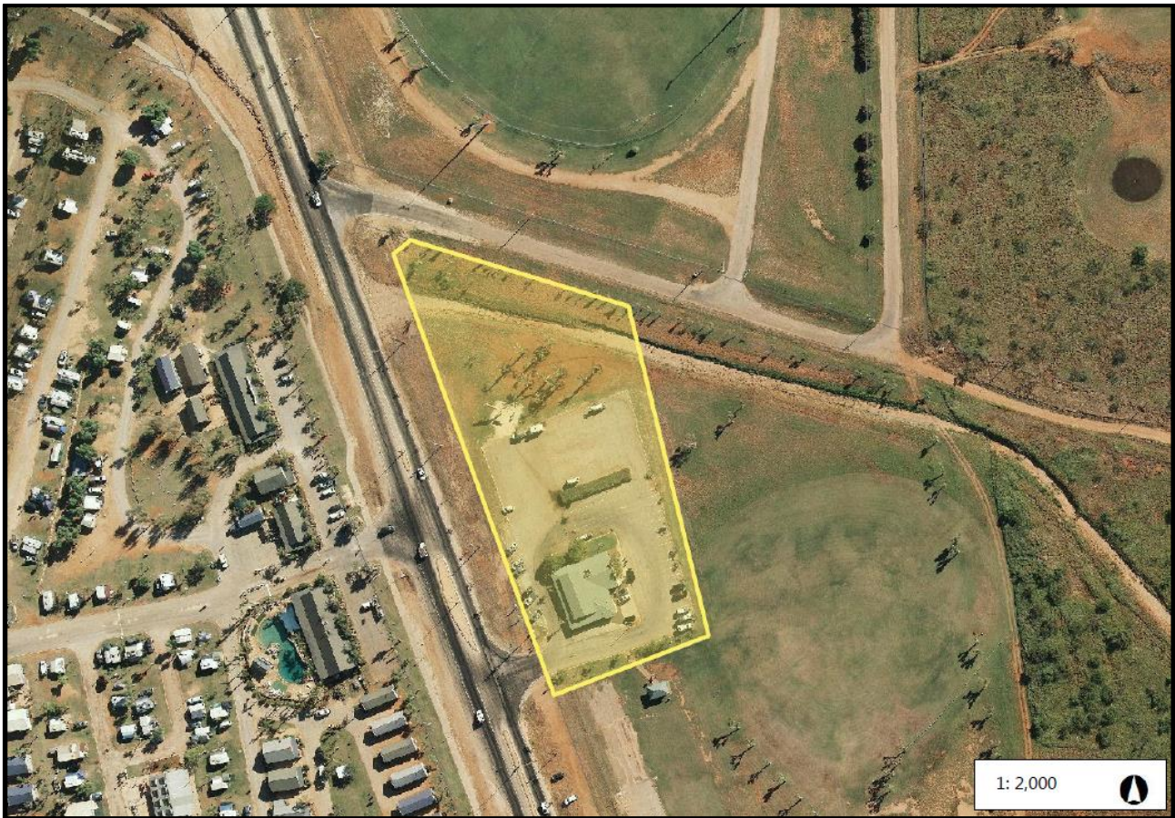
Location Plan – Reserve 45402, Lot 1432 Murat Road