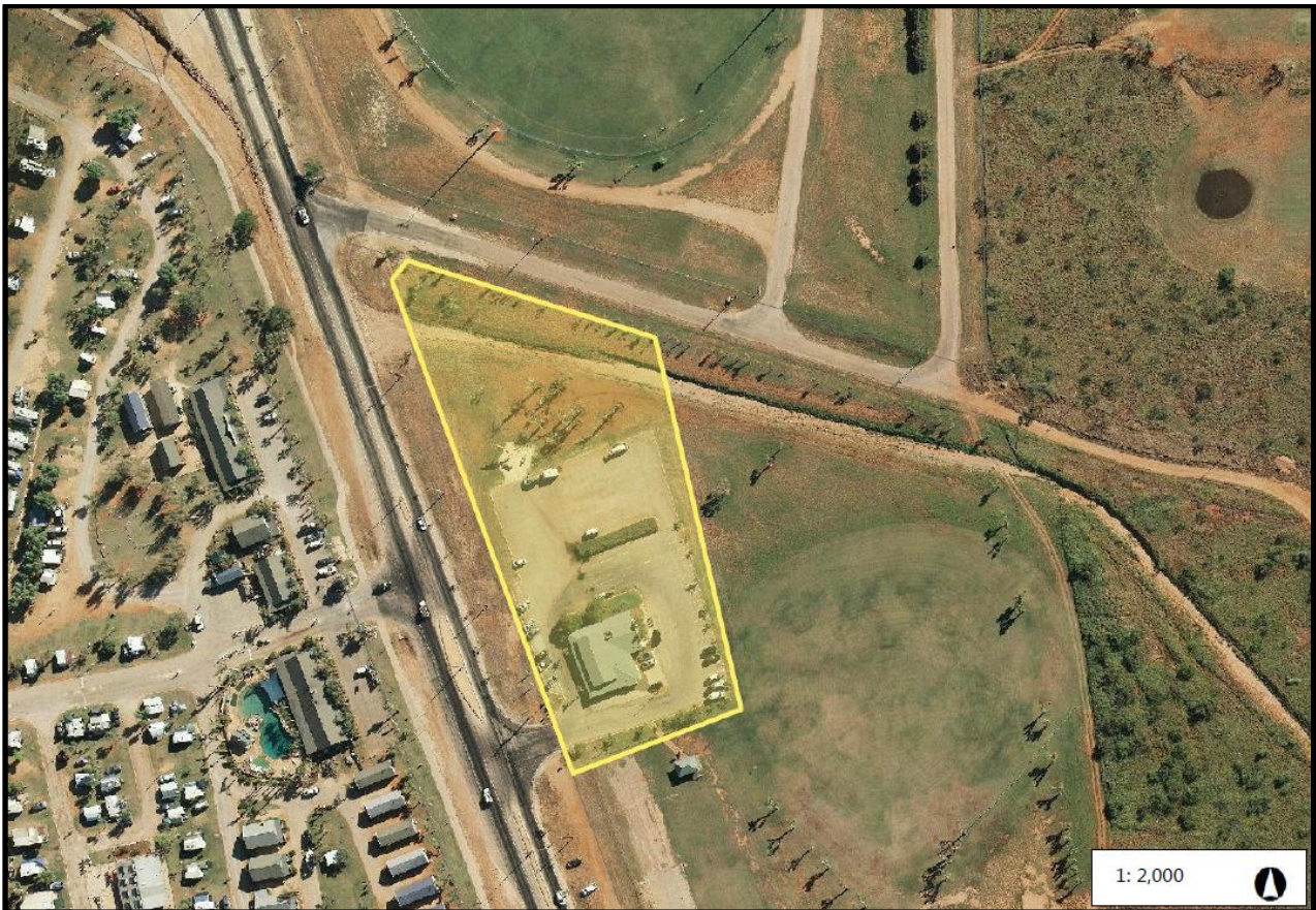
Location Plan – Reserve 45402, Lot 1432 Murat Road, Exmouth