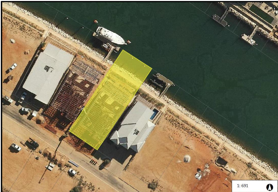
Location Plan - Lot 390 (19) Corella Court, Exmouth

The subject lot has a substantially constructed dwelling, is approximately 941m 2 in area and zoned Residential R20 in Town Planning Scheme No. 3. The subject property is a canal lot located in the Exmouth Marina Village Precinct 'A'. It has previous planning approvals for a single dwelling (PA165/13), deck (PA166/13), jetty (PA63/13) and a spa (PA85/16). The aerial image below identifies Lot 390 (19) Corella Court where the proponent seeks development approval for Holiday Accommodation use.