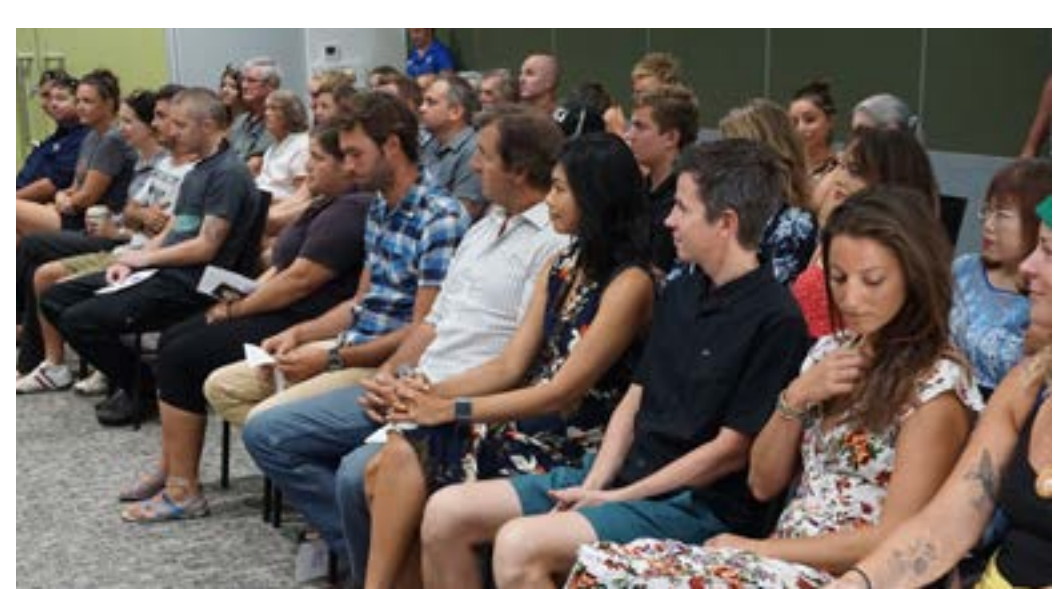
ELECTORS & RESIDENTS at the Mandu Mandu Function Centre

ouncillors represent the Shire's electors and residents. They will work cooperatively to meet the responsibilities of this role from making decisions about policies, infrastructure and public facilities while considering the allocation of and pressure on Shire resources. This guide highlights some of the critical factors relevant to being a Councillor at the Shire of Exmouth. Becoming a Councillor can also be a rewarding role and an opportunity to contribute to the community and influence decisions that affect the community.