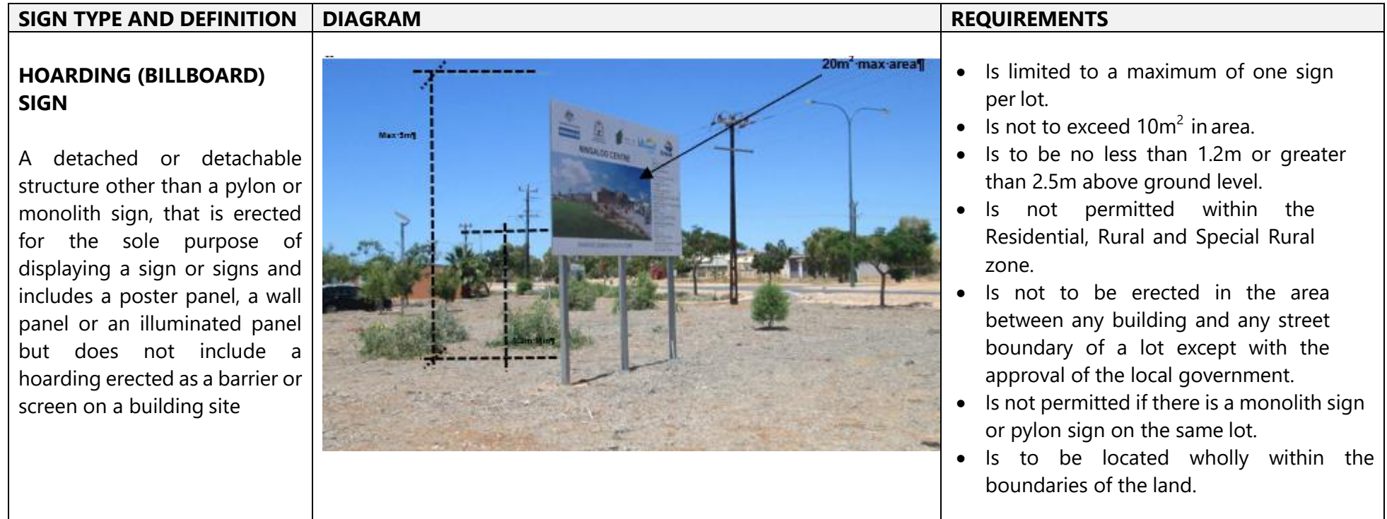
TABLE 1: ACCEPTABLE STANDARDS FOR VARIOUS SIGN TYPES