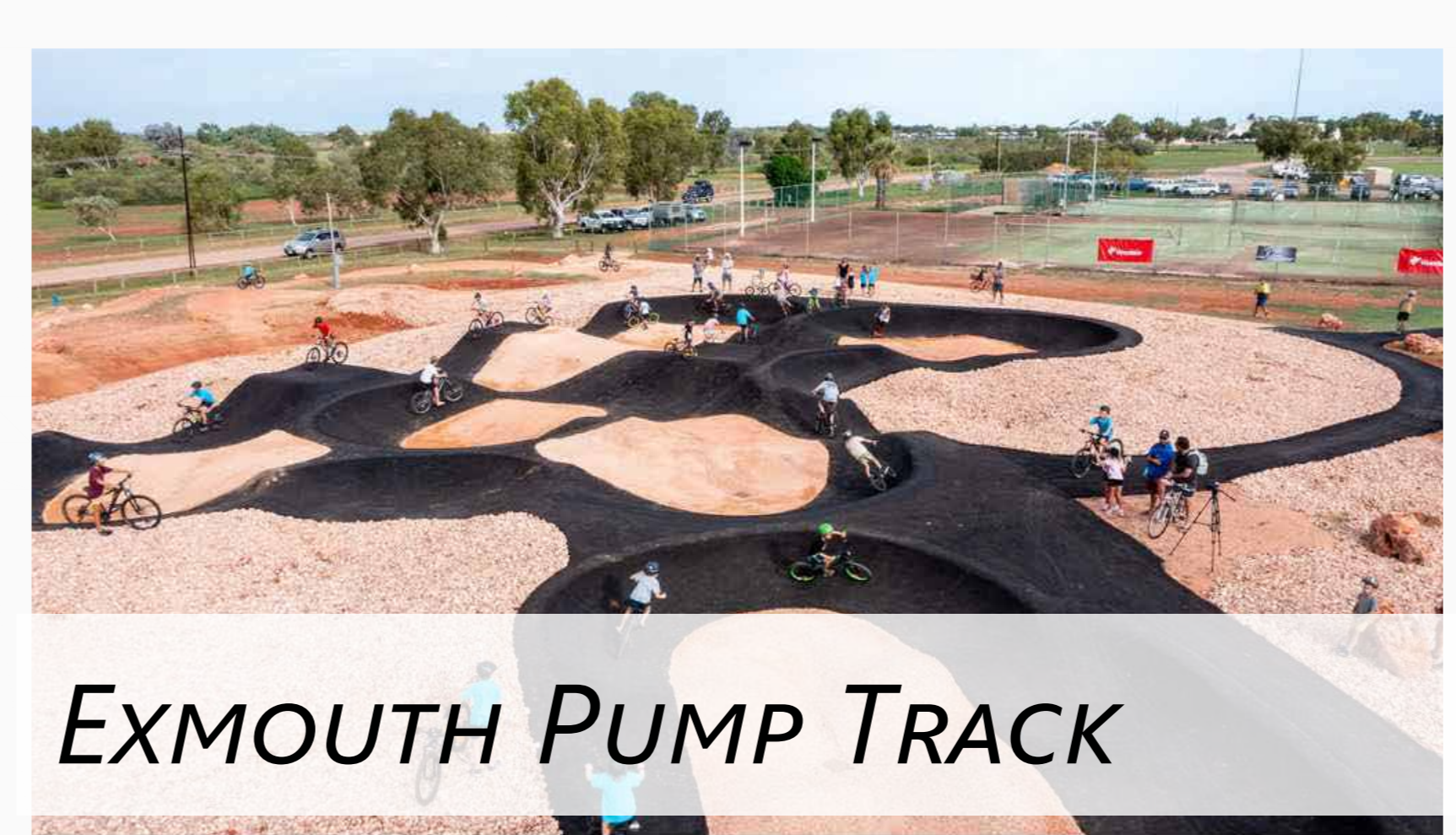
EXMOUTH PUMP TRACK