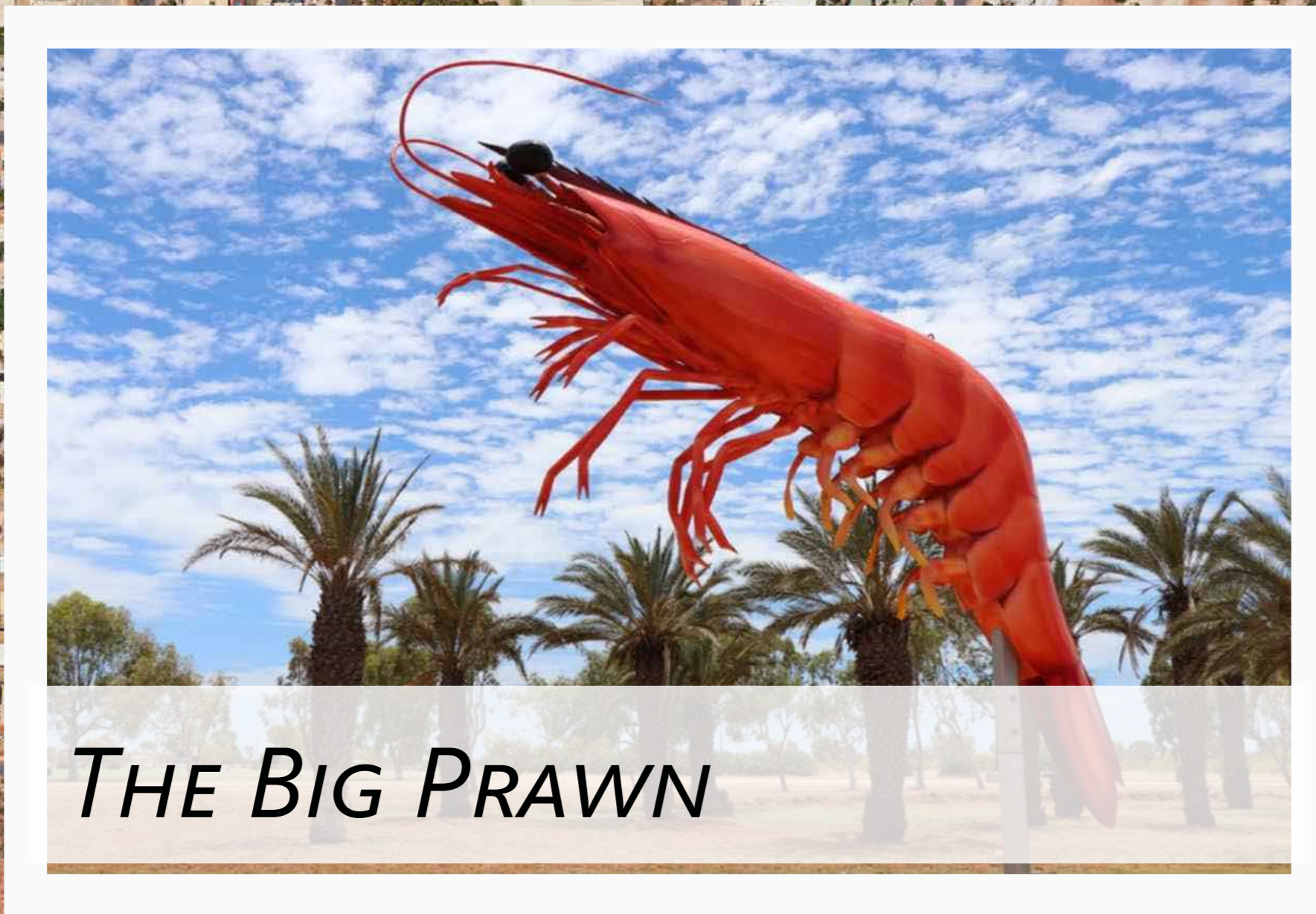
THE BIG PRAWN