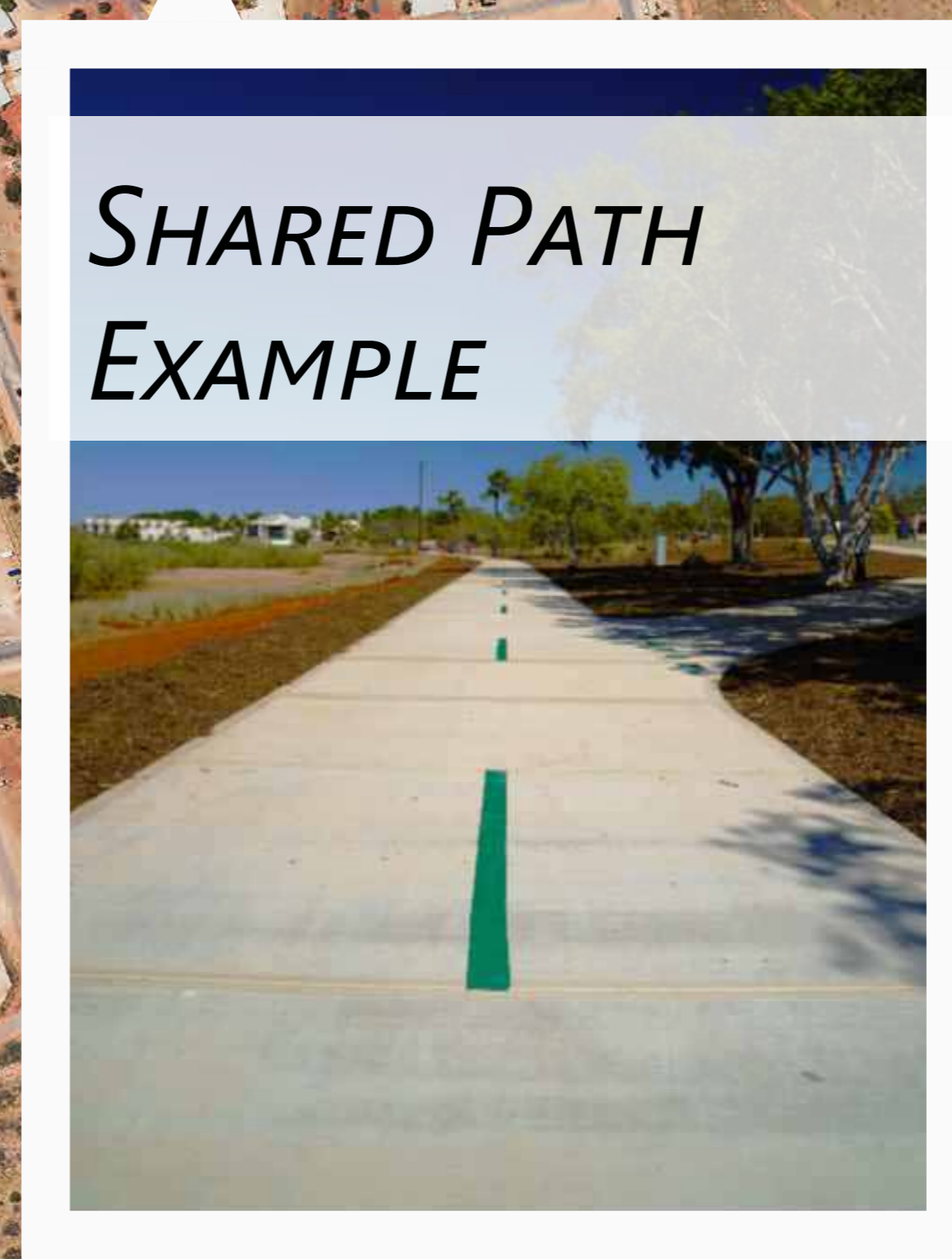
SHARED PATH EXAMPLE