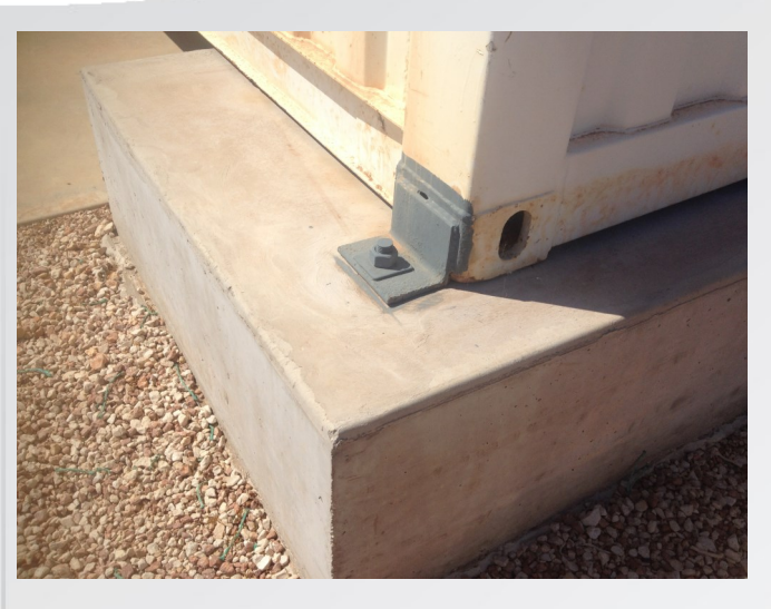
Pictured: A properly secured sea container

"We are asking all residents with sea containers that have not been formally approved to lodge an application as soon as possible," he said.