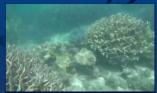
Go for a snorkel on Ningaloo Reef where there are hundreds of species of coral and fish