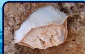
Megalodon ( Charcharodes megalodon ) shark tooth at Cape Range. This shark was up to 18 m long about three times the size of Great White sharks. They became extinct about two million years ago