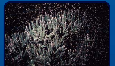
Coral spawning is how corals reproduce. At Ningaloo, this occurs around March each year, 7-10 days after the full moon

Corals mainly reproduce through an amazing phenomenon called 'Coral Spawning'. One, and sometimes multiple nights each year, corals release millions of tiny eggs and sperm into the water. This allows fertilisation from surrounding colonies to occur, resulting in coral larvae. These 'planulae' travel in ocean currents for about a week until they find a suitable rocky reef to settle and grow into a new coral colony. This mass of coral spawn also provides a feast for marine life with masses of krill and other tiny marine creatures swarming on the reef to feed on the spawn, which in turn attracts larger visitors like the whale sharks.