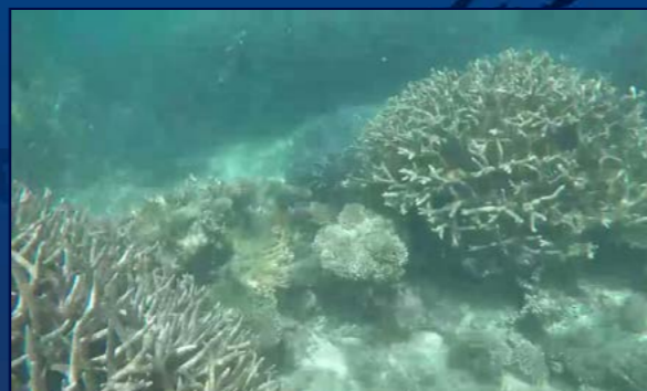
Go for a snorkel on Ningaloo Reef where there are hundreds of species of coral and fish