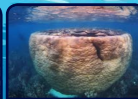
Porites/boulder hard coral is the slowest growing at 1 - 3 cm per year. Colonies can grow to several metres in diameter and be hundreds of years old

The high biodiversity is attributed to the warm Leeuwin current coming from the north and the close proximity of the continental shelf to shore allowing coral reef and oceanic species to coexist in a small area.