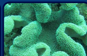
A leather soft coral with distinctive coral polyps. When the polyps are retracted, the coral has a smooth leather like appearance

(pronounced zoo-zan-thel-lee) in the polyp tissues through photosynthesis. This is why coral reefs grow in shallow and clear tropical waters.