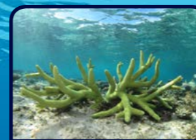
Staghorn/branching hard coral is the fastest growing at 10-15 cm per year and most widespread, providing a protected home for small fish.