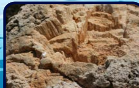
Extensive fossil remains can be seen throughout Cape Range, which was formed on the seabed millions of years ago.

The addition of the Cape Range peninsula has brought the mainland closer to the edge of the continental shelf and the Leeuwin Current. Over time this has enabled the development of the Ningaloo Reef and its biodiversity.